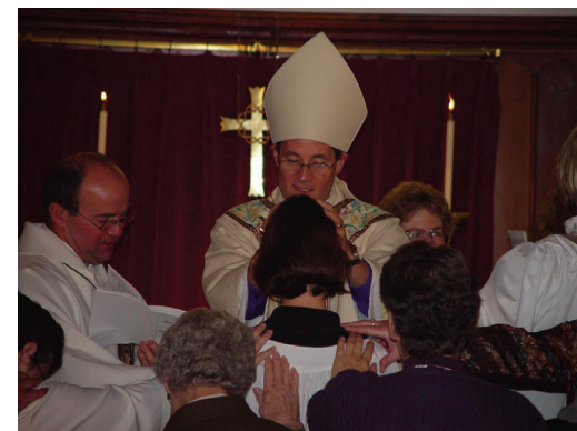
Commissioning for Ministry in Gladstone, MI